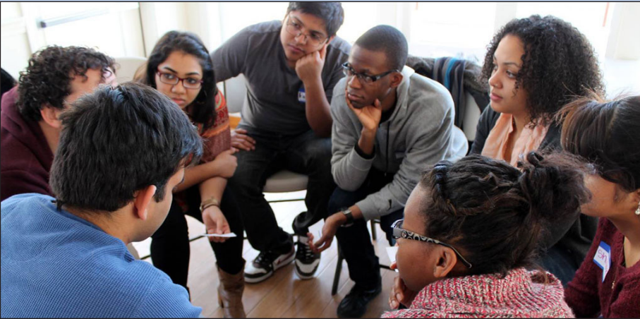
Students at the Brandeis PossePlus Retreat participate in a small group workshop about class.

Each year, Posse Scholars identify an important issue to explore with the larger campus community at a weekend retreat called the PossePlus Retreat (PPR). This year’s PPRs entitled, “What’s Your Worth?” challenged 3,500 participants at 37 Posse partner colleges and universities to discuss the topic of class, power and privilege in America.