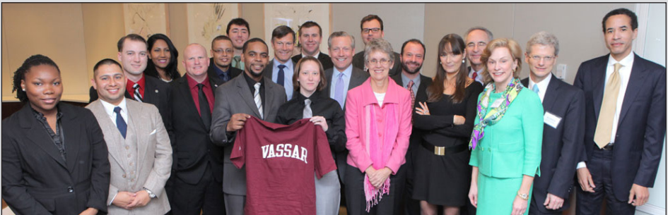
The first Vassar Veterans Posse with representatives from Infor, Moody’s, Posse and Vassar.

In January, at an awards ceremony in New York City hosted by Moody’s Corporation, The Posse Foundation and Vassar College recognized 11 veterans of the U.S. Armed Forces as members of the first Veterans Posse.