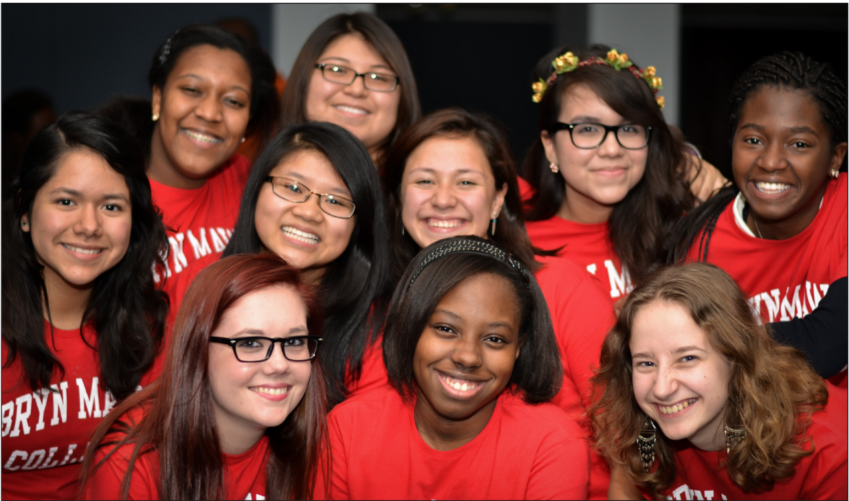
Houston's first Bryn Mawr Posse.

To date, Posse has identified, recruited and trained more than 4,800 Scholars who have collectively won $577 million in merit-based scholarships from the nation’s top colleges and universities. ✱