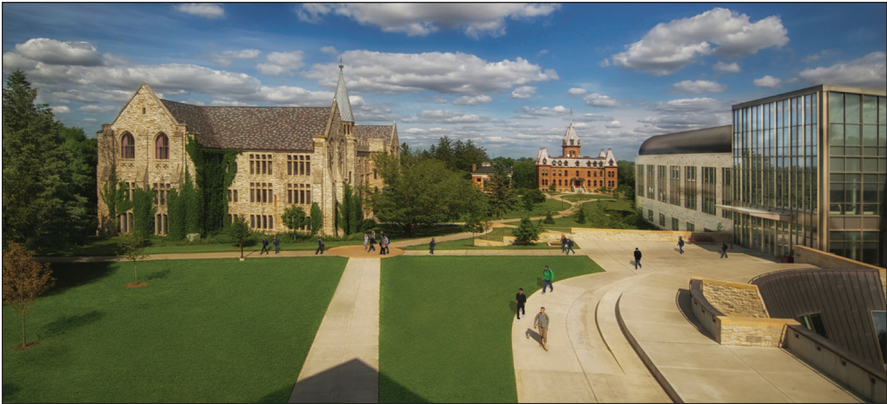
St. Olaf College in Northfield, Minnesota, will recruit Scholars from Posse Chicago.