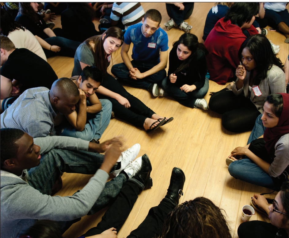
Attendees of the Brandeis PossePlus Retreat participate in a small group discussion.

PossePlus Retreats aim to facilitate community building and productive dialogue while exploring a topic on a national, campus and individual level. Past PPR topics have included social responsibility and education. POSSE