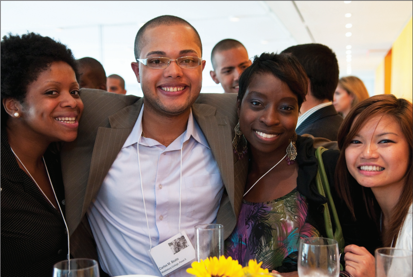
see “ALUMNI” on Page 4 A few of the Alumni attendees of the National Posse Alumni Leadership Conference. .....