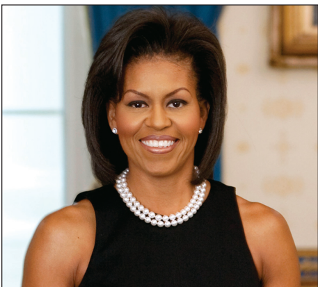
First Lady Michelle Obama.