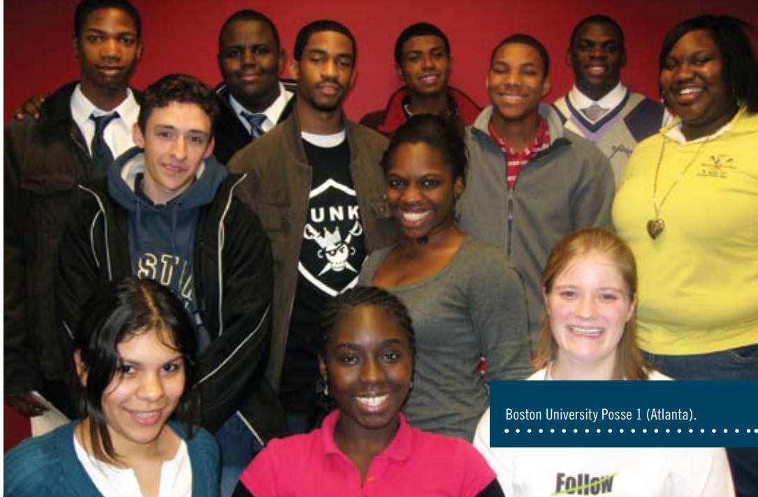
Boston University Posse 1 (Atlanta).

Founded in 1989, The Posse Foundation identifies public high school students with extraordinary academic and leadership potential who may be overlooked by traditional college selection processes. The Foundation extends to these students the opportunity to pursue personal and academic excellence by placing them in supportive, multicultural teams—Posses—of 10 students. The Foundation's partner universities award Posse Scholars four-year, full-tuition leadership scholarships.