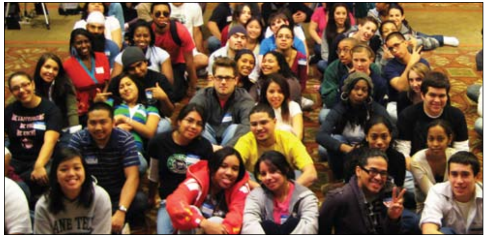
Students participate in Posse workshop.

Although the remaining 410 candidates will not be eligible for a Posse Scholarship, students can opt to have their application profiles made available to each of Posse's partner institutions through Posse Access. In so doing, Posse is greatly expanding the pool from which participating colleges and universities can recruit highly qualified students.