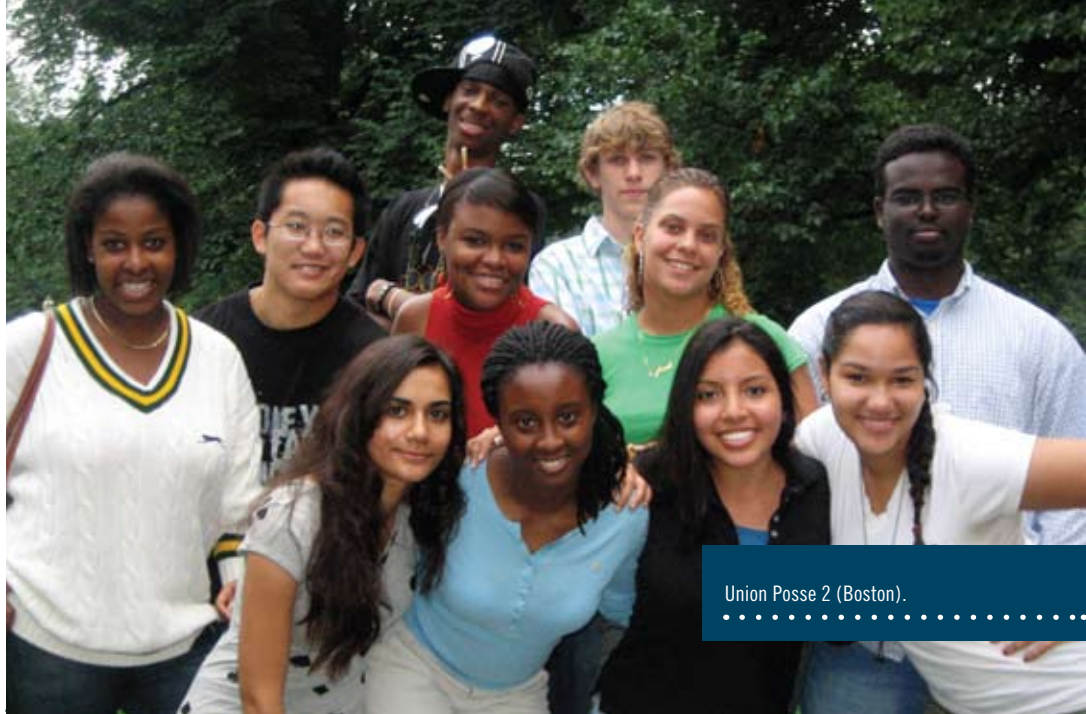
Union Posse 2 (Boston).

Founded in 1989, The Posse Foundation identifies public high school students with extraordinary academic and leadership potential who may be overlooked by traditional college selection processes. The Foundation extends to these students the opportunity to pursue personal and academic excellence by placing them in supportive, multicultural teams ("Posses") of 10 students. The Foundation's partner universities award Posse Scholars four-year, full-tuition leadership scholarships.